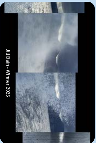
Jill Bain - Winner 2025

We encourage everyone to submit a panel: whether it's a project you're proud of or simply a chance to try something new, it's a great opportunity to share your work and explore your creativity. Each member may submit up to two digital and two printed panels. Panels are usually made up of 2-6 images.