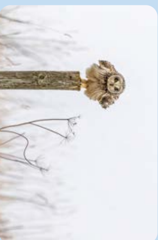
3rd Print Comp Oct '25