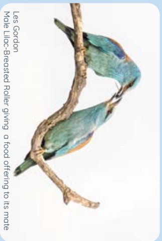
Male Lioo-Breasted Roller giving a food offering to its mate

AGM, 'REFLECTIONS VOTE' AND BEST OF YEAR Our last session of the year. The AGM will be followed by a show of the "Reflections" Submissions and a winner will be chosen. After Tea we will celebrate the year with our Annual Best of Year display.